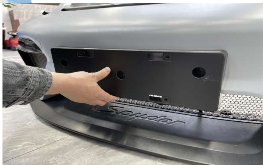
27. Secure the license plate with screws