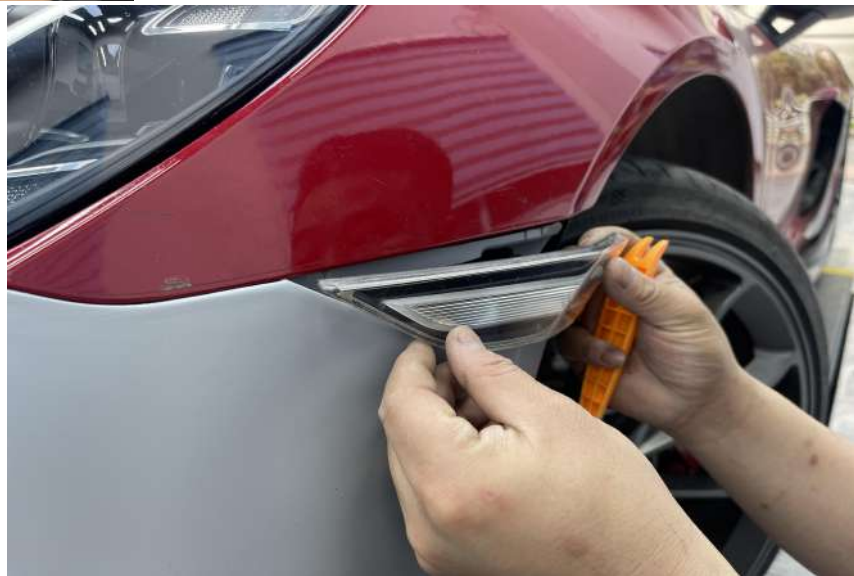
25. Fixed turn signals in their original positions