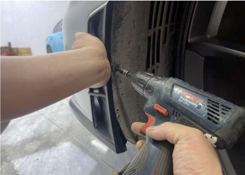
24. Original fender fixing screws