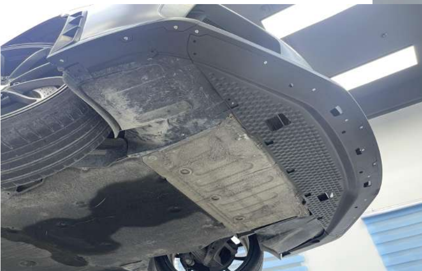
26. Fixed chassis screws